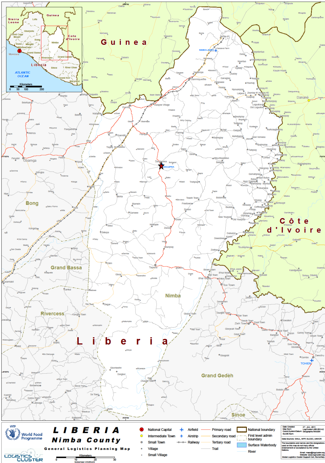
Figure 1. Map of Nimba County